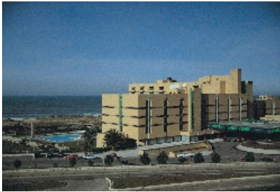
The 5-stars-hotel SOLVERDE