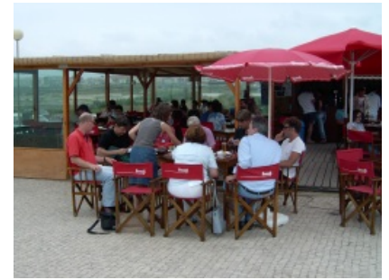
Our Beach Bar