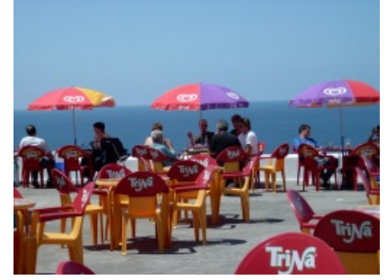
Terrace Restaurant at the Lighthouse