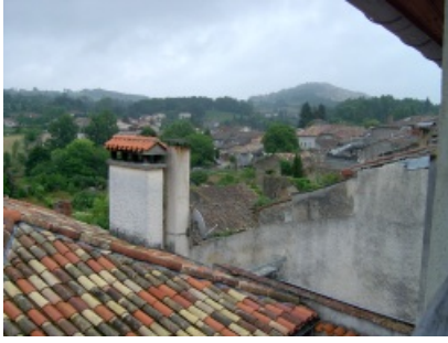
View over the roofs of Aurignac