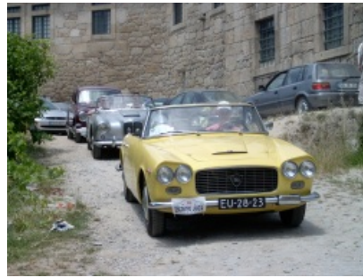
Alpendurada, a Monastery