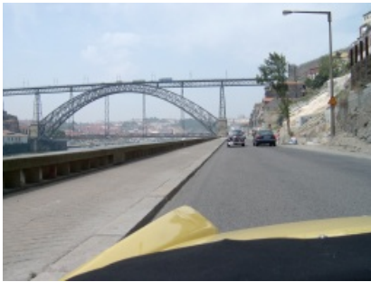
There are a lot of Bridges